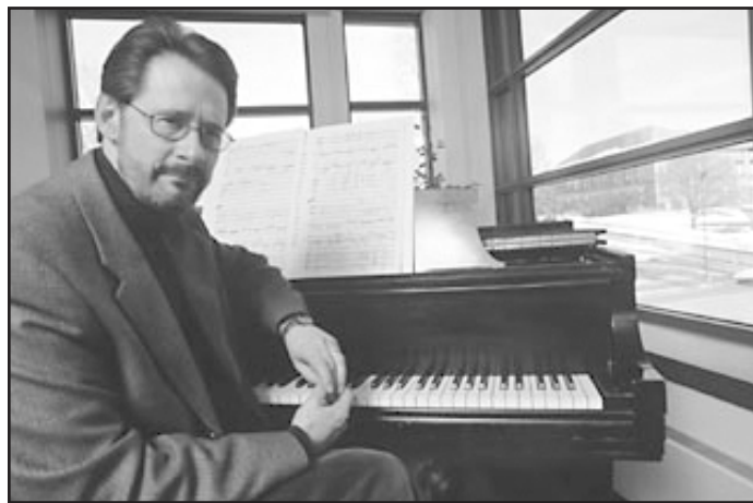
Playing Like a Pro... Eugene Youth Symphony members will play a piece composed by Steven Stucky at the Hult on Feb.